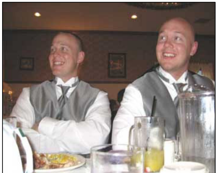
Here's a picture of the boys at the wedding.