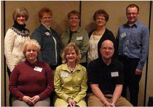
2011 Membership Committee