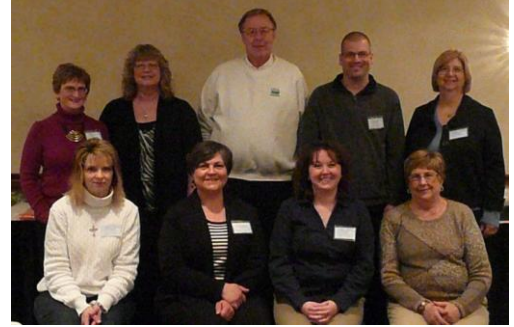
2011 Publicity Committee