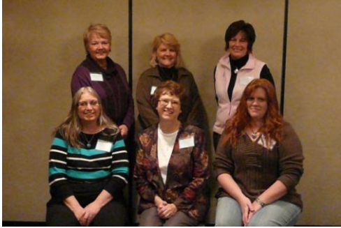
2011 Awards & Scholarship Committee