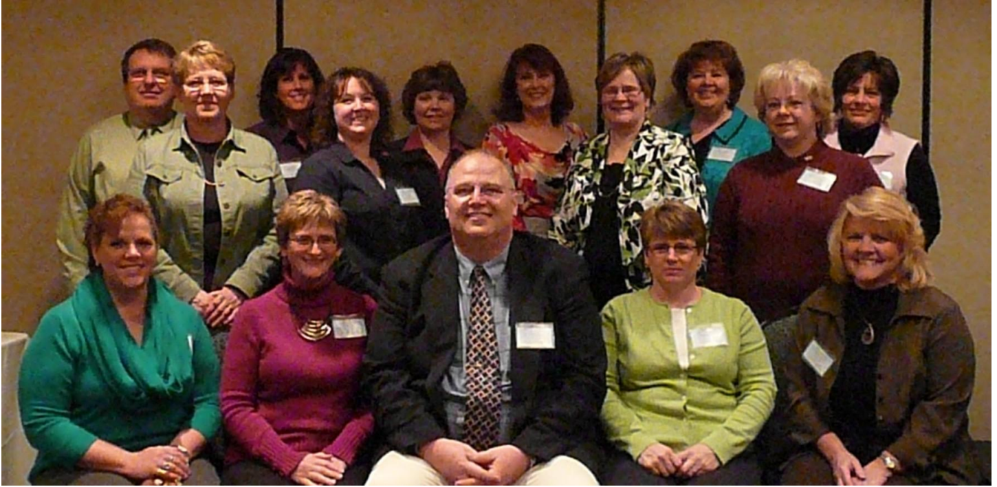
2011 IASCOE Directors