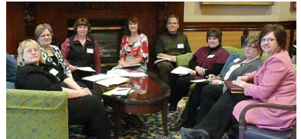
2011 Legislative and Benefits Committee