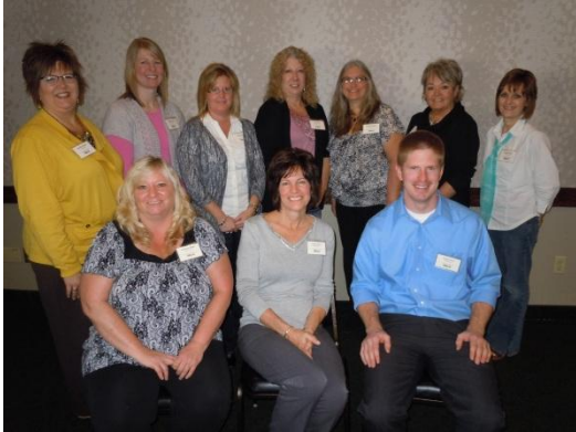
2012 Awards & Scholarship Committee