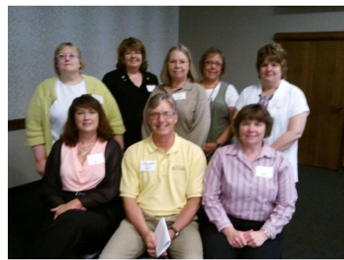
2012 Legislative and Benefits Committee