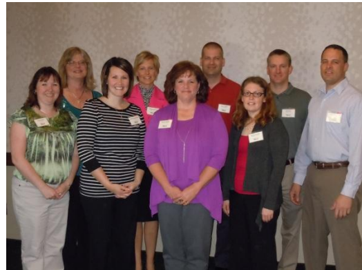
2012 Publicity Committee