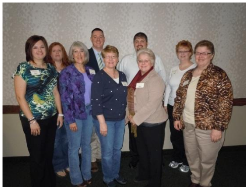
2012 Membership Committee