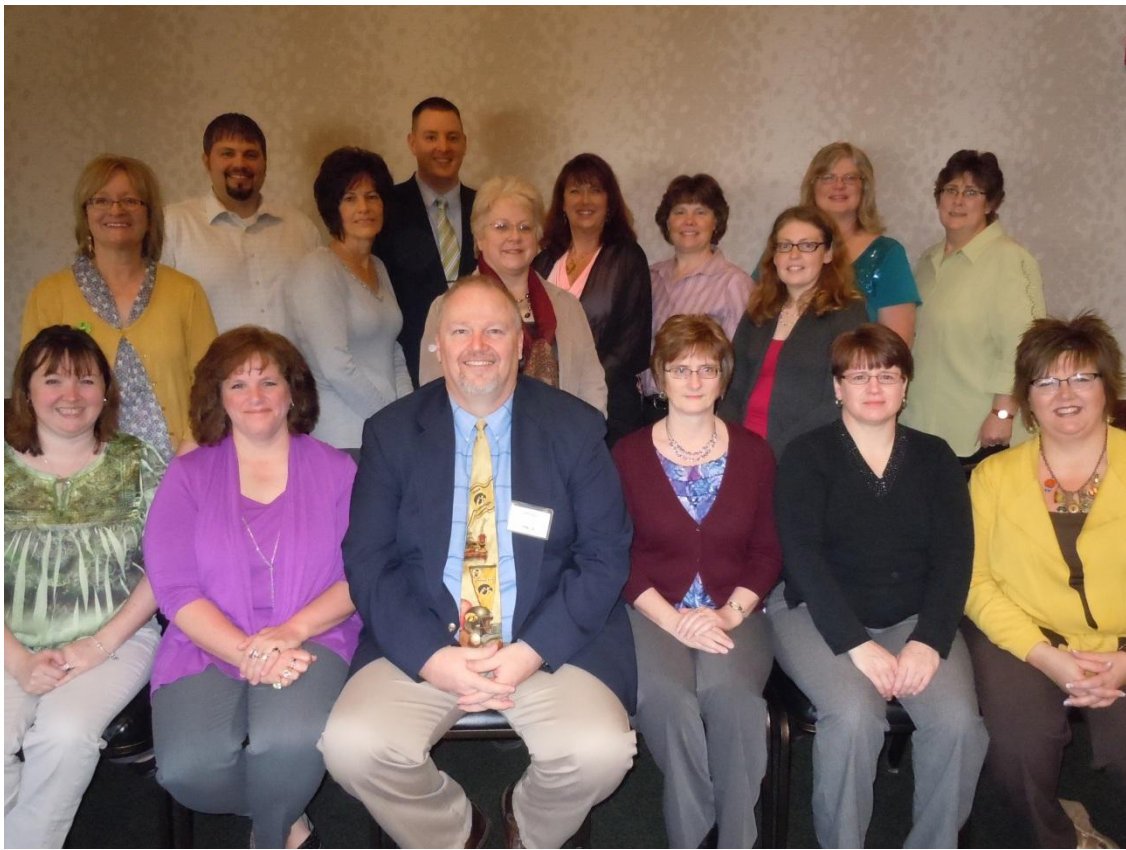
2012 IASCOE Directors